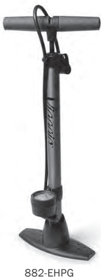
Built-in pressure gauge.